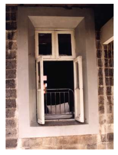
The hospital window

"This place smells like a latrine." They said. "We're getting you out of here. We'll look after you." I resisted them – I wanted to stay in the hospital but they climbed in the window, picked me up, put me over their shoulders and walked me out. The doctor came and tried to physically restrain them but they pushed him out of their way. A taxi was waiting. Simon wouldn't come in the taxi with me as he was still afraid that I was a ghost. They took me home to my bungalow on the beach and put me to bed. Then they went straight out to the living room and had a party!