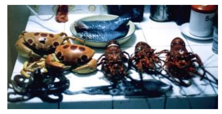
A typical seafood harvest

After surfing my heart out on Tamarin's very fast left-hand reef break for several weeks, I was running out of money. So I headed to South Africa where I found a job teaching windsurfing and water-skiing. Amazingly they actually paid me to do this! I surfed Jeffrey's Bay and Elands Bay and visited some of South Africa's world famous wildlife reservations.