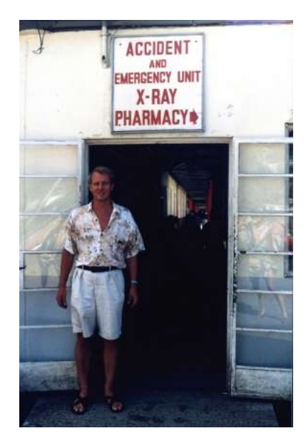
lan outside the hospital in 1994

The ambulance turned off the road in to the hospital. Finally I had made it! The driver lifted me into a wheelchair and ran me through to the emergency area. Someone took my blood pressure. As I was sitting there watching the nurse she looked at the gauge and then she hit it. I thought, "What kind of hospital is this?" It was an old World War Two army hospital. The British had deserted it and given it to the Creole people. It still looked like it was built in 1945. It was filthy and decrepit and yet there I was.