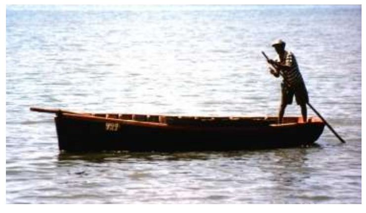
Wooden boat in Mauritius

My two friends lifted the boat over the reef with me in it. It was ripping the bottom. It was a wooden boat, and the boat was their livelihood, so I knew the situation was very serious for them to be doing that. They lifted the boat over into the lagoon and were swimming, trying to push the boat to get it going. I said, "Come with me!" But they replied, "No, it's too heavy, get the young boy to take you ashore". So this young kid was pushing the boat to shore with a pole.