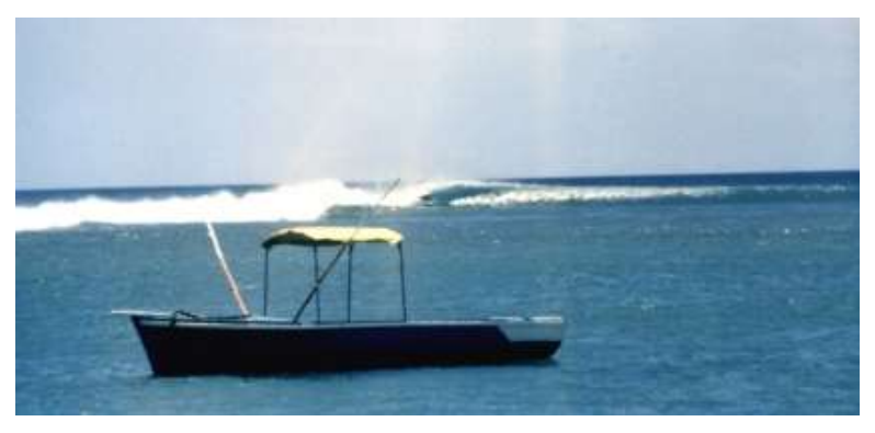
Surf break in Mauritius

At my stopover in Reunion I found an amazing surf break called St Leu where I had some great waves to myself. Then I headed on to Mauritius. It was March 1982 and I'd been travelling now for nearly two years, often sleeping in a tent on beaches and living like a nomad. It was time to return home.