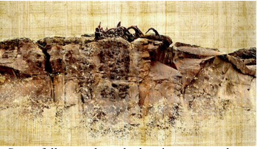
Some fell on rock, and when it came up, the plants withered because they had no moisture and the Sun burned them.