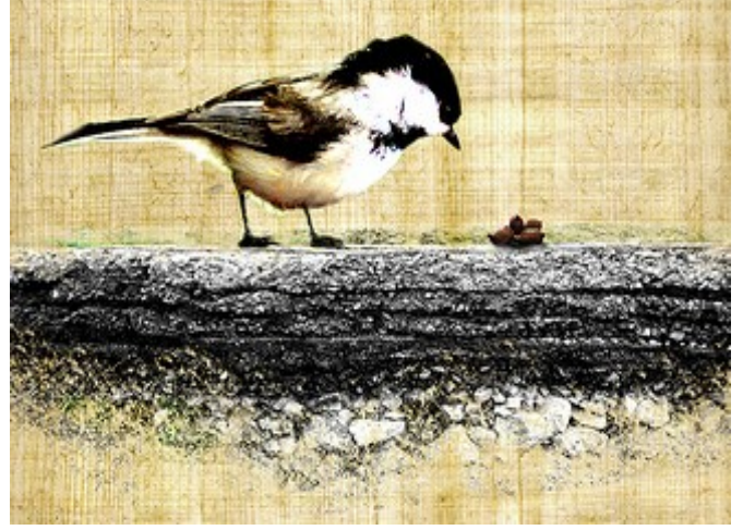
As he was scattering the seed, some fell along the path; it was trampled on, and the birds of the air ate it up.