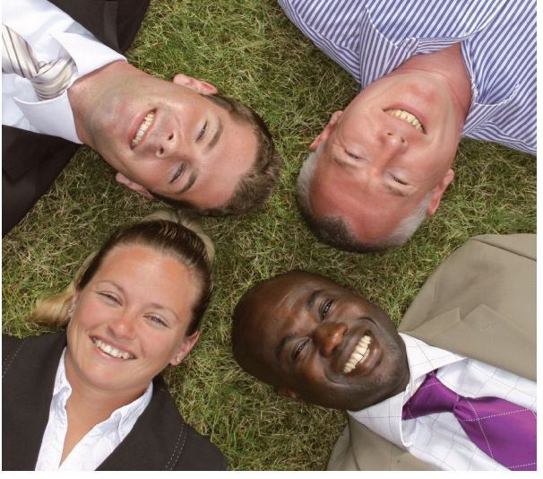
The 4 SOILS