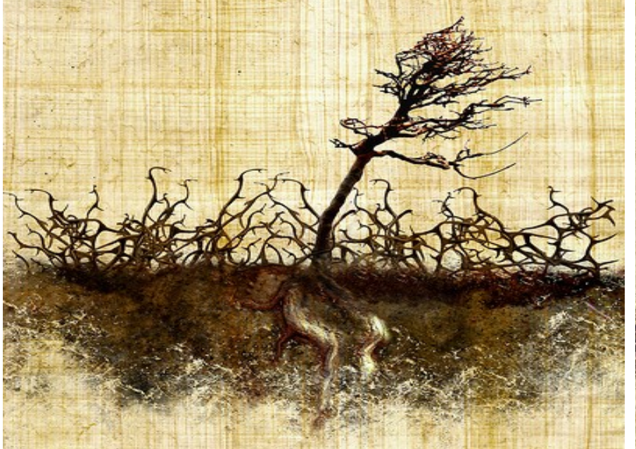
Other seed fell among thorns, which grew up with it and choked the plants.